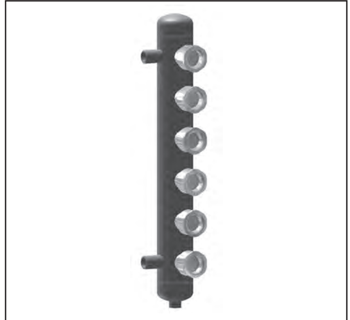
Phillips® Level Eye® Column (Shown with Side Connections)