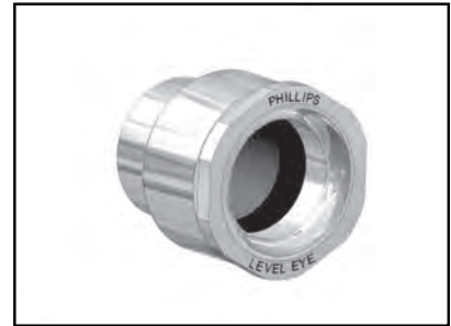
Level Eye® (See Bulletin 1100)

2" nominal dia. X 16" long with end connections and (2) Level Eyes®.