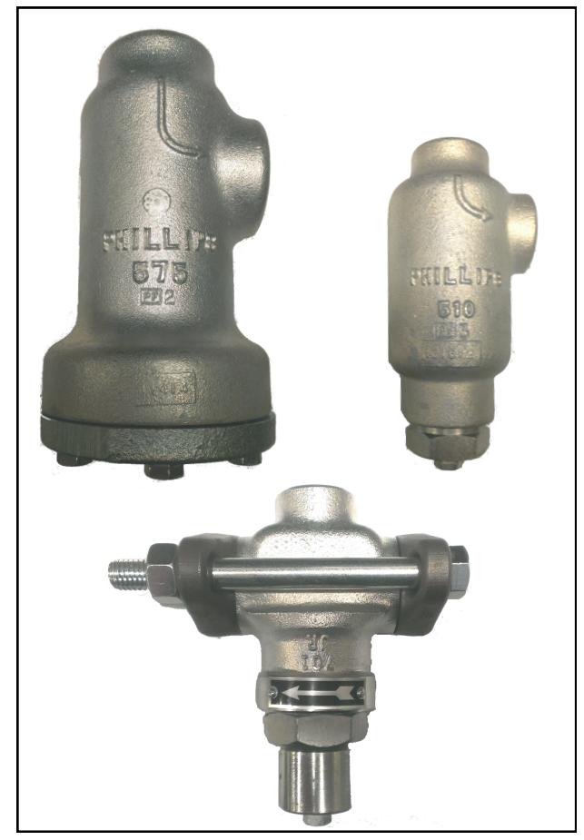
575, 510, and S701JRP Filters

Phillips ® offers three styles of compact filters to protect a variety of refrigeration equipment from particulate matter. The 510 and 575 styles are angle-type, typically used with Phillips' low-side float valves. These filters have FPT connections. The S701JRP is a flanged globe-style filter, typically used with small piston-type valves. All of these filters feature screen assemblies that are reinforced with perforated stainless steel sleeves.